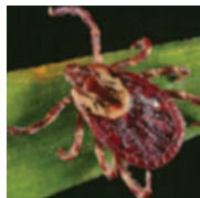
American dog tick