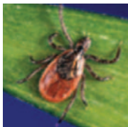
Black-legged “deer” tick