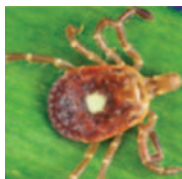
Lone star tick